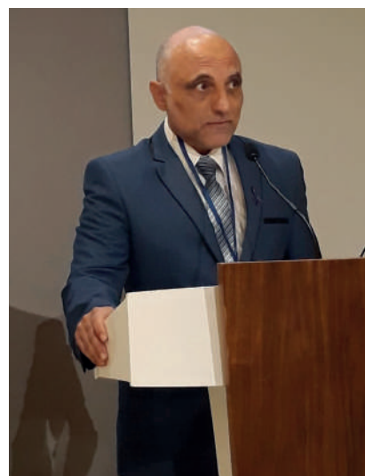
Chairperson of MACC addressing the participants