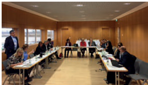
Stakeholders round table discussion on HPN, Munich, 22 October 2018

Discover the MNI factsheet on Medical Nutrition: https://medicalnutritionindustry.com/files/user_upload/documents/mni-factsheet-final-corr.pdf