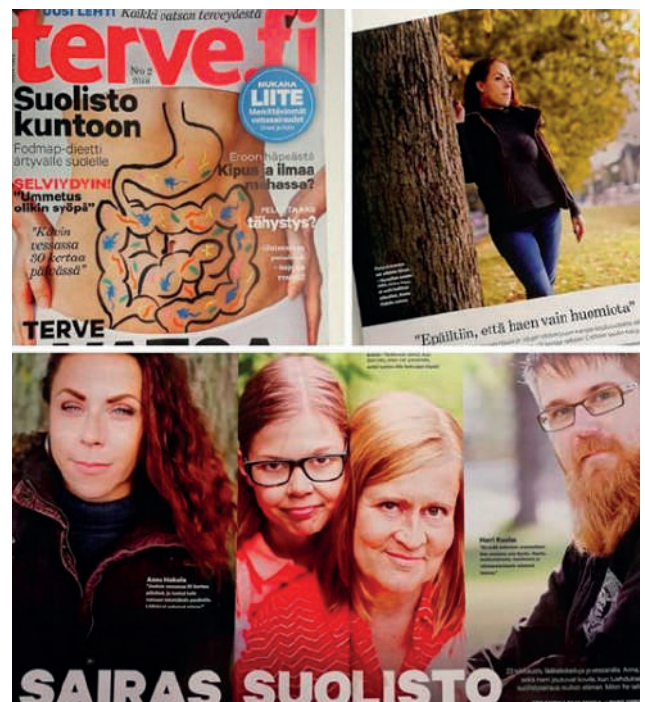
Raising awareness about IBD in the press