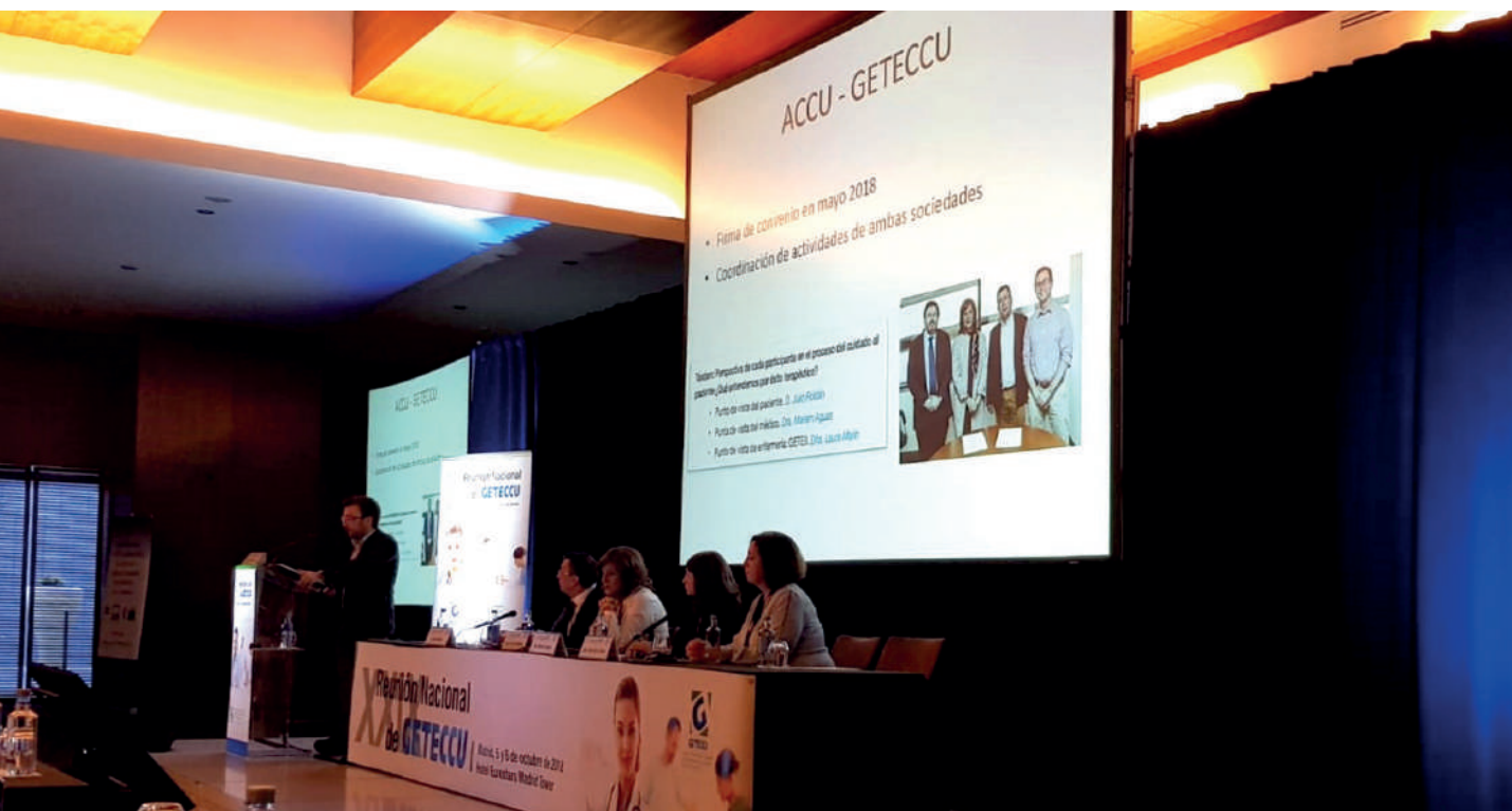
Panel discussion during the GETECCU Meeting, 5-6 Madrid 2018

Other outstanding conferences of the meeting were those that dealt with current issues such as the review of the management of specific situations ("the adolescent and the elderly").