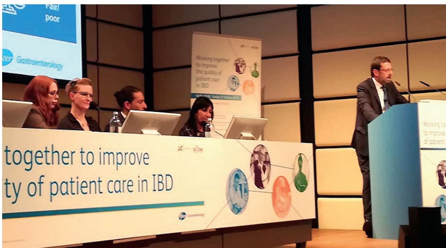
Panel speakers during the symposium, 21 October 2018, Vienna

For more about the UC Narrative please read the article on page 13.