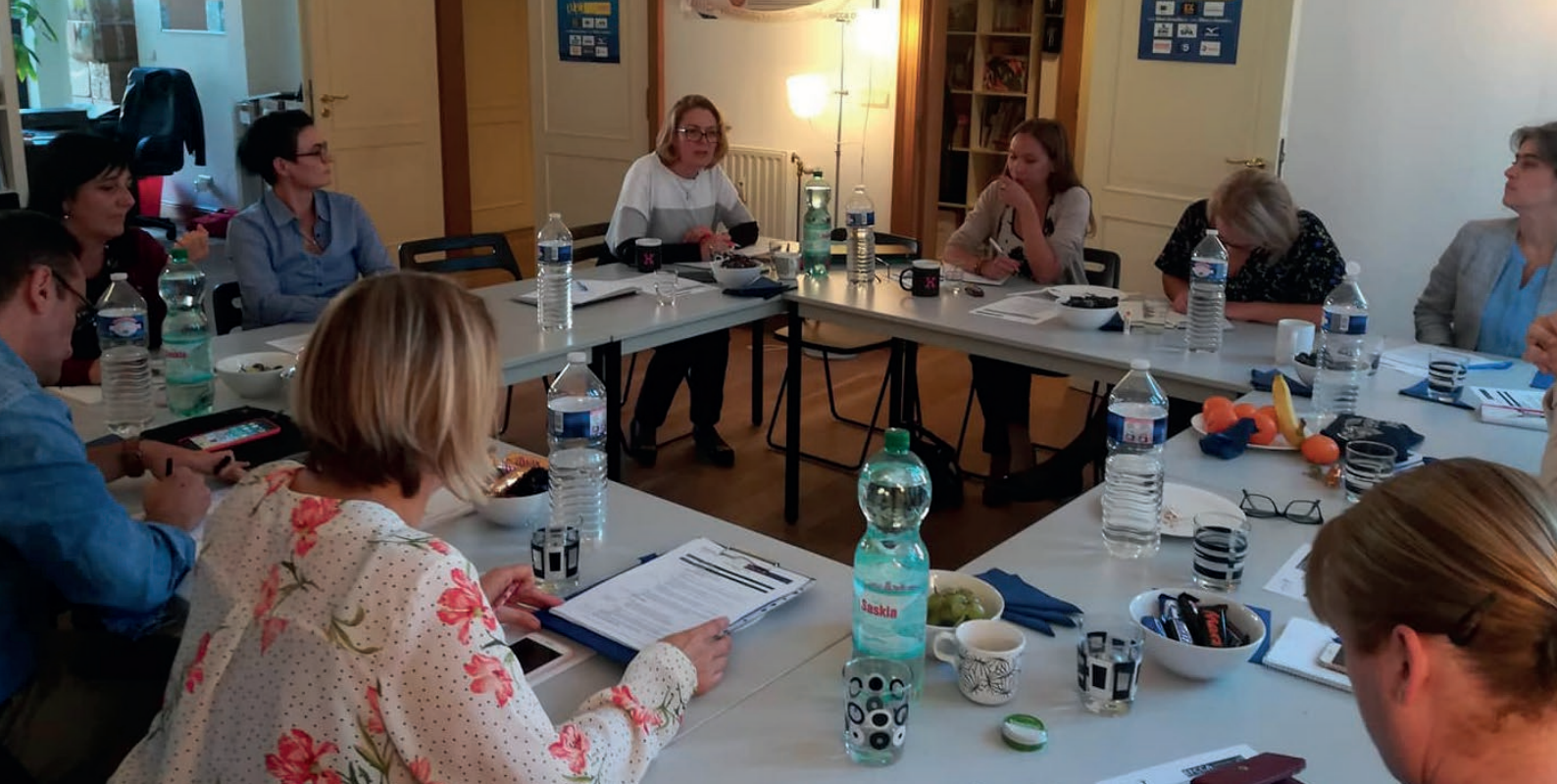
Participants at the focus group meeting which took place in October 2018, Brussels

We have produced a series of animation videos that help people through their IBD Journey. These videos aim to equip people with practical advice and relevant information and hopefully will bring about positive changes to the way they cope with their disease.