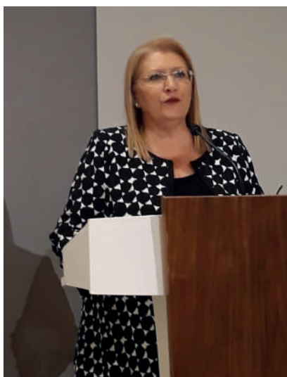
President of Malta (H.E. Marie Louise Coleiro Preca)